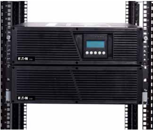
The 9135 (top) fits easily into a rack with an EBM (bottom) and a PPDM (not pictured)