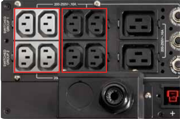
Independently control groups of output receptacles (230V models only)