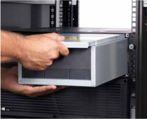
Even non-technical users can easily replace the hot-swappable batteries or power modules without interrupting power to loads