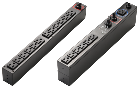
Optional FlexPDU and HotSwap MBP for greater flexibility and uptime